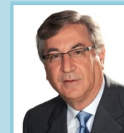
Karmenu Vella Environment, Maritime Affairs and Fisheries Malta, PES