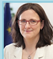
Cecilia Malmström Trade Sweden, ALDE