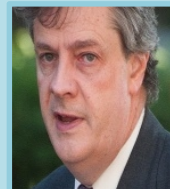
Jonathan Hill Financial Stability, Financial Services and Capital Markets Union UK, ECR