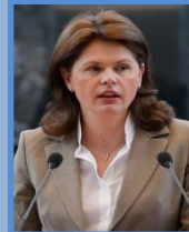
Alenka Bratušek Energy Union Slovenia, ALDE