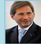
Johannes Hahn European Neighbourhood Policy and Enlargement Austria, EPP