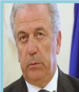
Dimitris Avramopoulos Migration and Home Affairs Greece, EPP