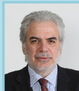
Christos Stylianides Humanitarian Aid and Crisis Management Cyprus, EPP