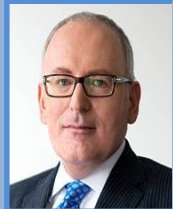
Frans Timmermans Better Regulation, Rule of Law, Inter-Institutional relations The Netherlands, PES