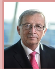
Jean-Claude Juncker President of the European Commission Luxembourg, EPP