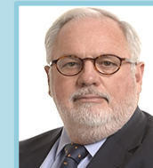
Miguel Arias Cañete Climate Action & Energy Spain, EPP