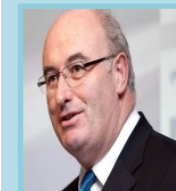
Phil Hogan Agriculture and Rural Development Ireland, EPP