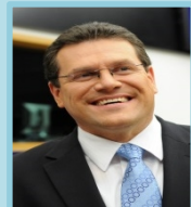
Maroš Šefčovič Transport and Space Slovakia, PES