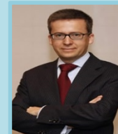
Carlos Moedas Research, Science and Innovation Portugal, EPP