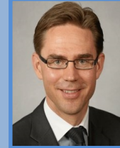
Jyrki Katainen Jobs, Growth, Investment and Competitiveness Finland, EPP