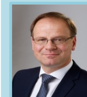
Tibor Navracsics Education, Culture, Youth and Citizenship Hungary, EPP