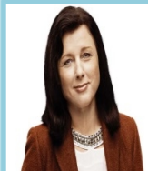
Věra Jourová Justice, Consumers and Gender Equality Czech Republic, ALDE