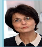
Marianne Thyssen Employment, Social Affairs, Skills and Labour Mobility Belgium, EPP