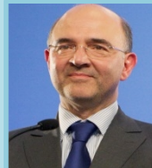
Pierre Moscovici Economic & Financial Affairs, Taxation and Customs France, PES