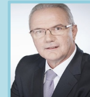
Neven Mimica International Cooperation and Development Croatia, PES