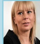
Elżbieta Bieńkowska Internal Market, Industry, Entrepreneurship & SMEs Poland, EPP