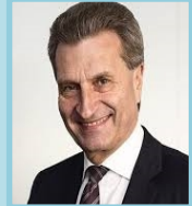
Günther Oettinger Digital Economy and Society Germany, EPP