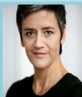
Margrethe Vestager Competition Denmark, ALDE